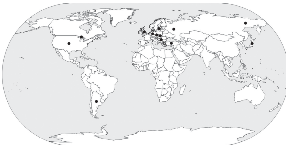
Fig. 3. The worldwide distribution of Actinocyclus normanii based on our studies and literature sources (see above).

Actinocyclus normanii (f. subsalsus ) from our samples occurs in waters with moderate to high conductivity (348–918 \mu\text{S}/\text{cm} ), pH ranges from 8.0–8.83, at a water temperature between 8.0–25.7 °C with a maximum abundance at 16.2 °C (Table 1).