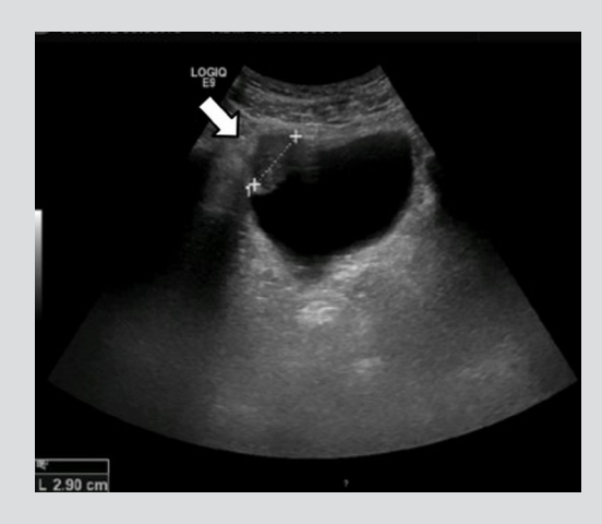
Figure 1: Bladder ultrasound revealing an urothelial carcinoma (white arrow).