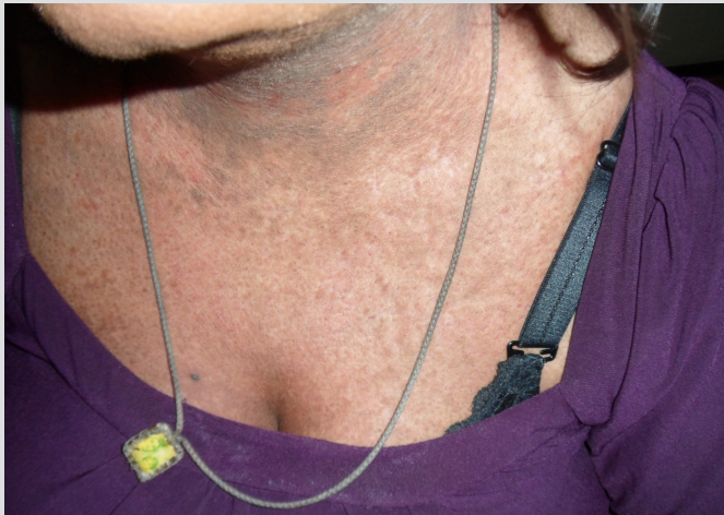
Figure 1: Erythematous rash on the patient's chest