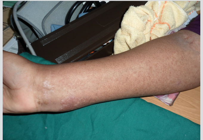
Figure 2: Erythematous rash on the patient's arms