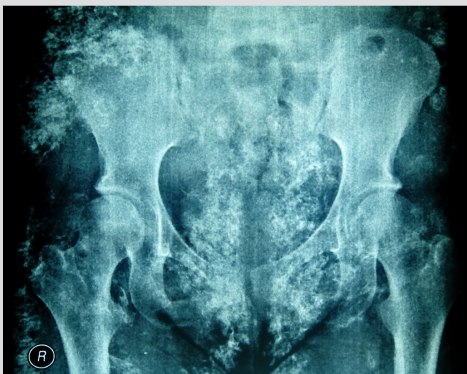
Figure 5: X-ray of the patient's pelvis

muscle power improving to grade 5 in the proximal muscles.