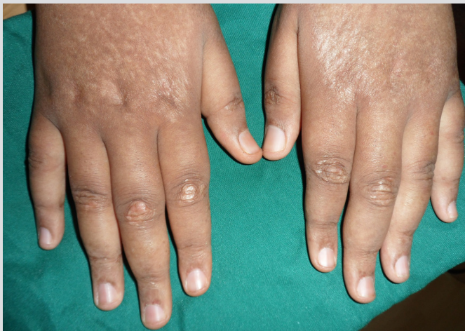
Figure 3: Gottron's lesions on the dorsum of the patient's proximal interphalangeal joints