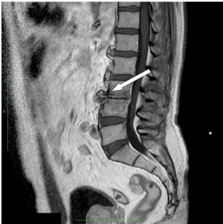
Figure 2: MRI of the lumbar spine performed 1 year later revealed stabilized outcome of the previous infection characterized by spondylosis associated with structural irregularities of the cortical bone of L 3 -L 4 . The discs included in the section L 1 -L 5 had undergone a degenerative process.

The discs included in the L 1 -L 5 section had undergone a degenerative process (Fig. 2).