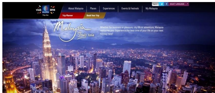
Figure 6 Homepage of official tourism website on Malaysia

sophisticated photo of the tower among the buildings is in fact the truest visual representation of the reality of the uniqueness and diversity of Malaysia (see Figure 6). The use of full colour saturation, bright colour tone and great pictorial detail are the main indicators ( Kress & Van Leeuwen, 2006)