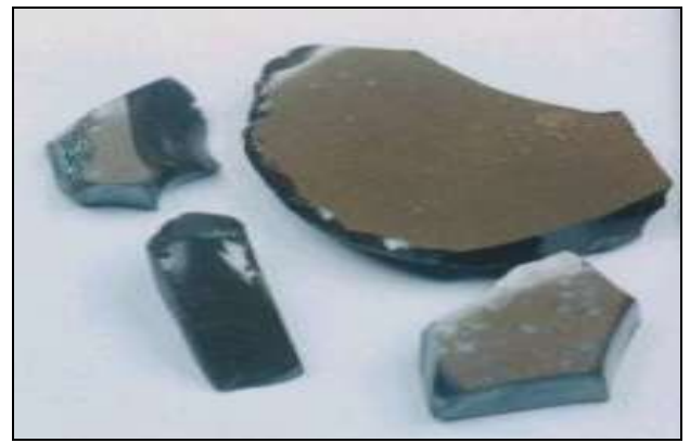
Figure 1 Sewage sludge molten slag from high temperature melting treatment [7]

Molten slag produced by a slow cooling rate (less than 5°C per minutes) was found to exhibit the lowest heavy metals contents in the leachate [7]. Figure 1 shows the molten slag samples that have been produced from the high temperature melting treatment. Past studies have indicated that high temperature melting treatment could convert sewage sludge into products that can be either reused or land filled without adverse environmental effects [5]. This paper will focus on the possible utilization of sewage sludge molten slag as aggregate substitute in asphalt mixtures for pavement construction.