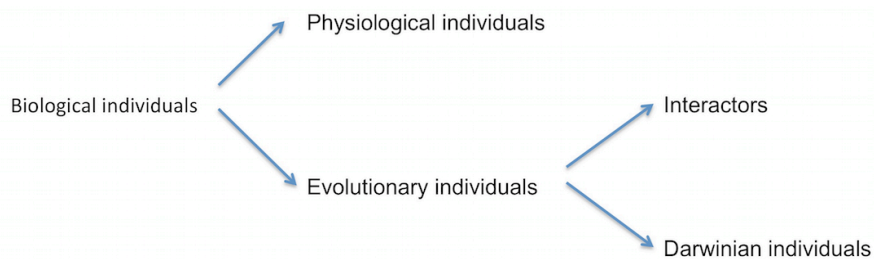
Fig. 2. Two important subcategories of biological individuals. Biological individuals can be physiological individuals or evolutionary individuals. Among evolutionary individuals, one can distinguish interactors and Darwinian individuals .

Therefore, the landscape of the different conceptions of biological individuality that coexist in present literature is rather complex, and could be schematically represented as in Figure 2 .