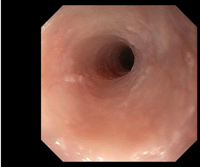
Fig. 1. Esophagogastroscopy before the onset of apremilast treatment shows LPM esophagitis with esophageal stenosis 20 cm ab ore.