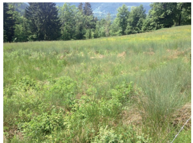
Figure 4. A swampy area making a potentially suitable habitat for Galba truncatula ; notice the rush as an indicator plant described by Rondelaud et al. (2011).