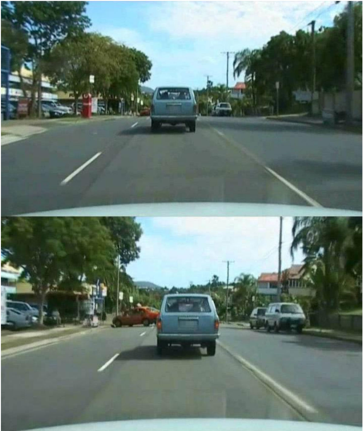
Figure 2. Images of a traffic hazard used in the present study. The blue car brakes, which means that the car containing the camera (effectively the participant's vehicle) would have to slow in order to avoid a collision. Importantly, it is possible for those participants with good hazard perception ability to anticipate this traffic conflict long before the blue car actually slows, as long as they are actively scanning the road beyond the blue car (where it is possible to see a taxi manoeuvring across the road ahead).

Figure 2 shows an example of a potential hazard sequence that was utilised by the current study. The HPT was run on a laptop with the video footage displayed to participants on a separate 4:3 aspect, 17 inch monitor, situated directly in front of them. Audio was muted for all video segments.