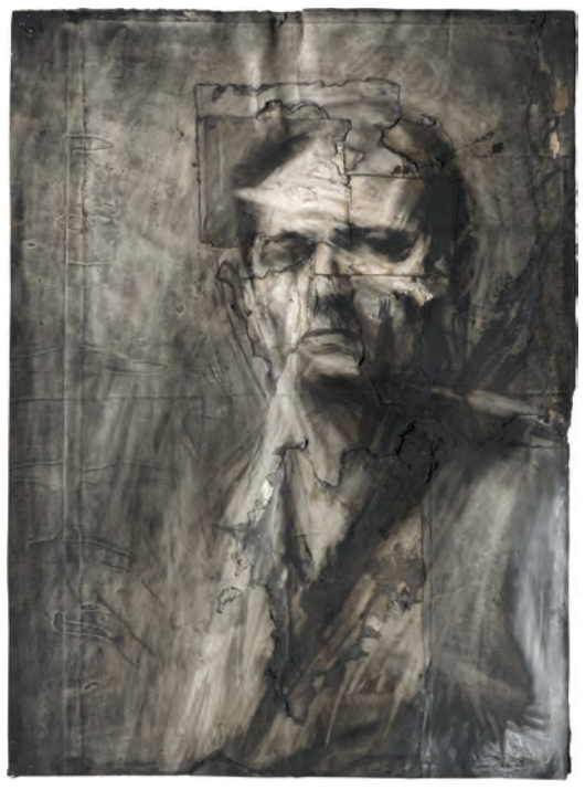
61. Self-portrait, by Frank Auerbach. 1958. Charcoal and chalk on paper, 76.8 by 56.5 cm. (Courtesy of Daniel Katz Gallery, London; exh. Tate Britain, London).