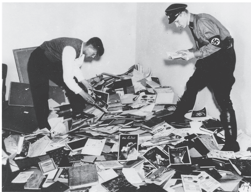
Figure 4.2 Members of the Hitler Youth select material for the book burning, 1933.

at pictures, while the soldier is reading a page in a book. Closer inspection suggests that the photograph was staged in a way that sought to dissociate the Nazi men from the content of the materials in which they are so immersed. The picture is well lit and carefully composed. Strategically placed at the front of the mountain of books and papers are a number of photographs of topless women, apparently taken from the journal Die Ehe , the institute's publication on marriage. The conspicuous inclusion of these images heterosexualizes the materials handled by the Nazi men. Nazi propaganda and policy tended to decry and persecute both pornography and homosexuality. 108 However, here the prominent placing of photographs of topless women suggests that homophobic anxieties shaped the raid on the Institute of Sexual Science. The representation of Nazi hands on naked women manages to maintain the institute's association with sexual immorality even as these images also ensure that the Nazi men sent to cleanse the institute of its holdings are dissociated from homosexuality. Sharon Patricia Holland has argued that "if touch can be interpreted as the action that bars one from entry and also connects one to the sensual life of the other, then . . . racism has its own erotic life. " 109 Holland's observation on "the erotic life of racism," by which