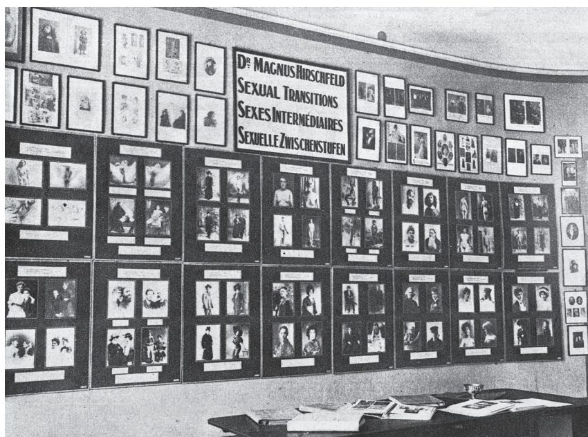
Figure 4.1 Hirschfeld’s archive, including display panels depicting “sexual intermediaries,” 1925. Bildarchiv Preussischer Kulturbesitz, 10002255.

role in transmitting long and complex written texts to a wider audience by depicting at a glance phenomena that in their written exposition covered hundreds of pages of scientific writing. In contrast to the often forbidding size of the printed books—and as part of some of his publications—the photographs offered a visual shorthand to the ideas of sexual intermediaries, providing more instantaneous access to Hirschfeld’s ideas. Furthermore, the display panels were portable, which increased the audiences Hirschfeld was able to reach with them, because he and his colleagues used the panels in public talks. The sexual intermediaries panels thus opened up the institute’s archives, making them accessible to the wider public who were introduced via the photographs to people who were “anders als die andern”: different from the others. 79