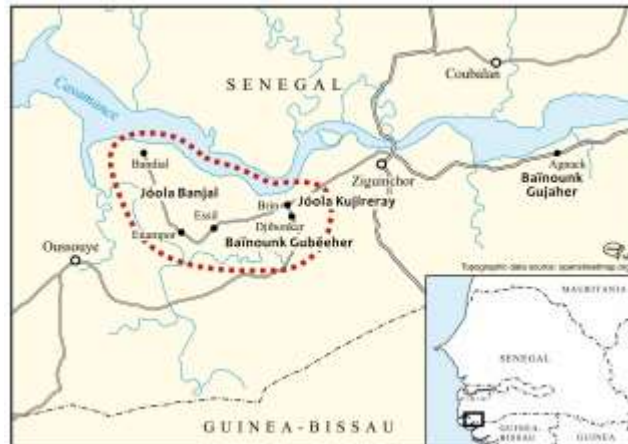
Figure 1. The crossroads area

Residents of the crossroads villages do not necessarily adhere to any one fixed ethnic identity, and the fluidity of their identity is projected through their linguistic practices. Through an exploratory study of greetings at this crossroads, this article seeks to examine the ways in which residents of the crossroads area identify through accommodation strategies of pronunciation. Specifically, the article seeks to answer the following research question: Is it possible that the prototypical pronunciation of the inhabitants of Essil has diverged from those of Brin and Djibonker as a way of distancing themselves from what they interpret as a Baïnounk identity?