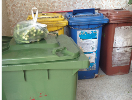
Fig. 1 Recycling bins located in a building entrance