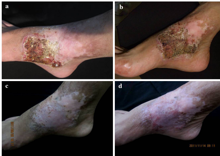
Fig. 1 Clinical aspect of chromoblastomycosis lesions of patient before and after therapy. There is an itchy erythematous plaque surrounded with veracious hyperplasia on the right ankle of the second patient (a), the clinical is not improved after took

ten years' antifungal drugs (b), and the lesion is obviously improved clinically after ALA-PDT irradiation combined with terbinafine (c, d)