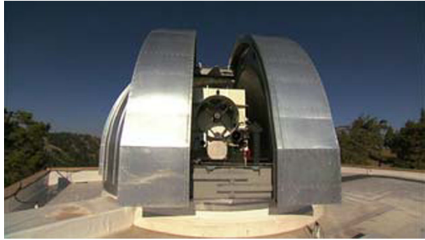
Fig. 5 The Lunar Lasercom OGS Terminal (OGS, at Tenerife, Spain)