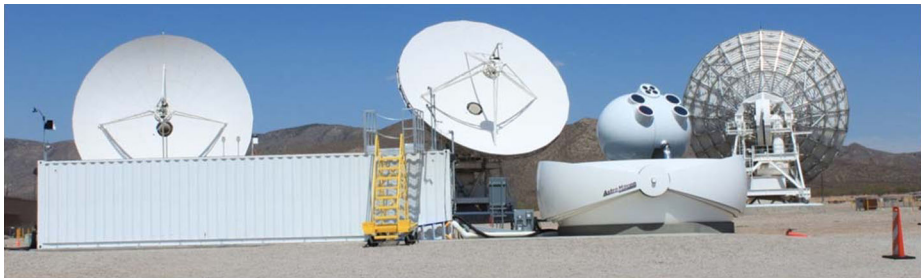
Fig. 3 The Lunar Lasercom Ground Terminal at site (White Sands, NM). The four smaller uplink telescopes can be seen grouped above the four 40 cm downlink telescopes