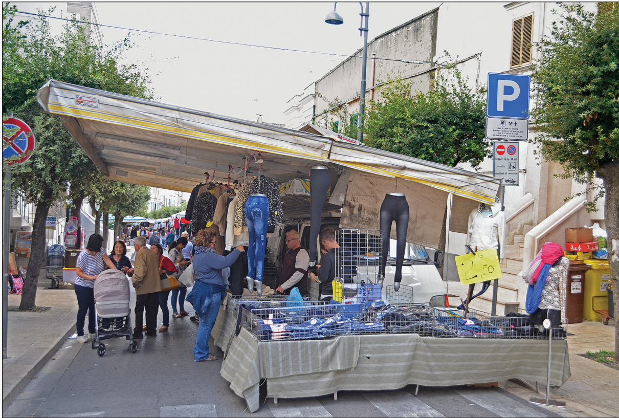
Figure 1. Street Fair.