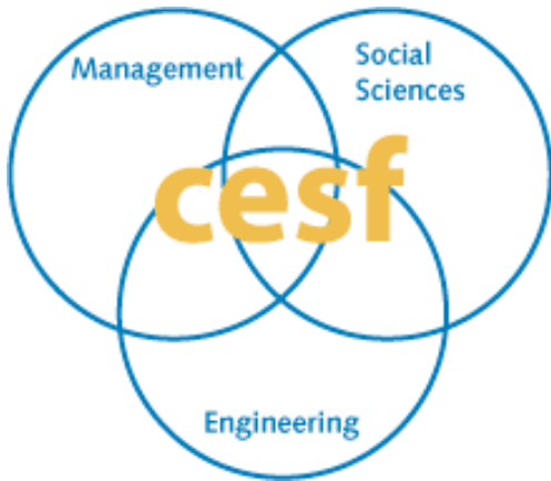
Figure 1. The Venn Diagram Intersection: Engineering, Management and Social Sciences