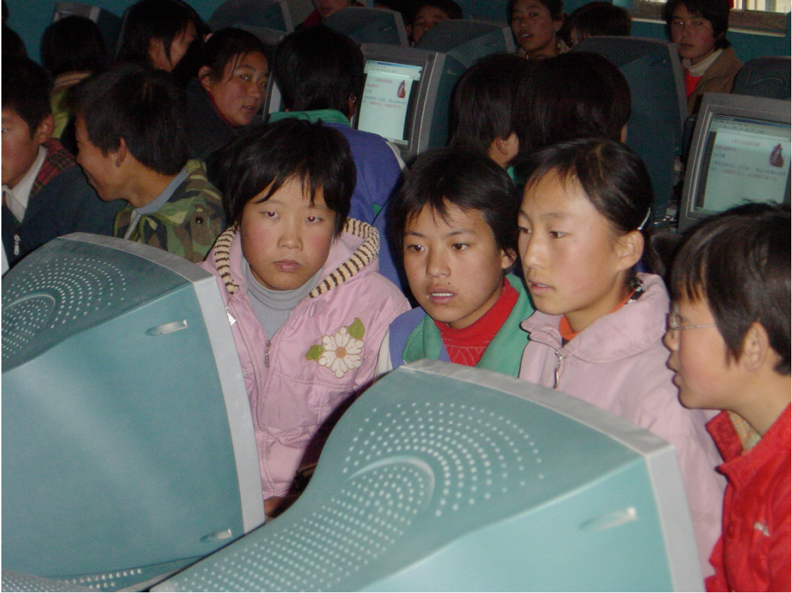
Figure 3. Middle School Students in an Unheated Classroom in a Farming Village in Ningxia Autonomous Region, PRC, Studying a Multi-Media Biology Lesson Delivered by Satellite (Late October, 2004).