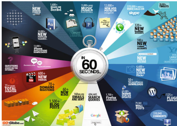
Fig. 1. Things That Happen On Internet Every Sixty Seconds. By Shanghai Web Designers, http://www.go-gulf.com/60seconds.jpg .

In practice, however, the data revolution is in its infancy, and there is still a big gap from the big data to the big picture, i.e., from the opportunities to the challenges. The reasons behind the gap are the following three.