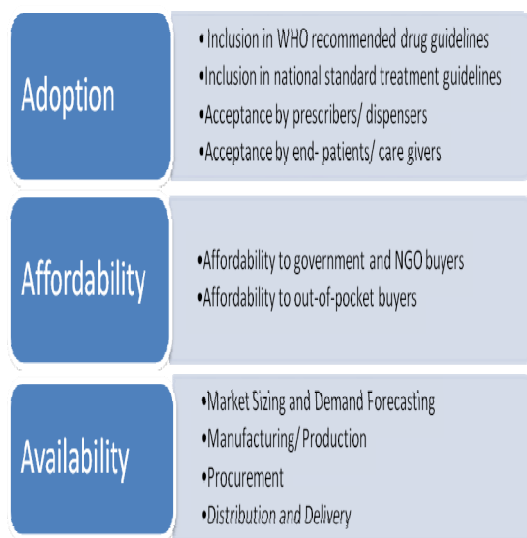
Figure 2 Factors affecting uptake of malaria medicines (Yadav, Stapleton, & Wassenhove, 2009)

Literature reviewed shows an increasing role of private sector in improving access to medicines but clearly points to a glaring knowledge gap in supply chain strategies to achieve effective distribution of pharmaceutical products in sub-Saharan Africa.