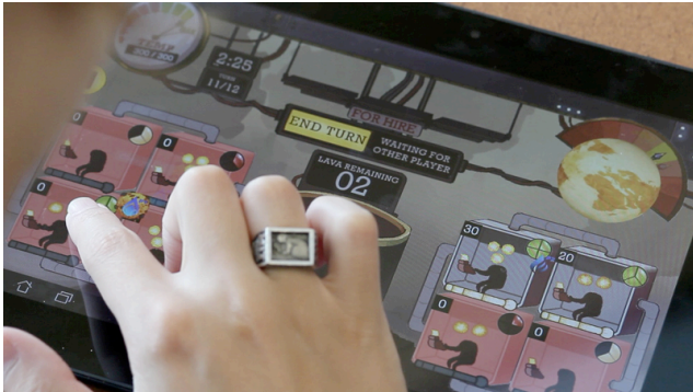
Figure 4: Tablet interaction for Movers and Shakers

Finally, tablets are easy to carry and distribute to different locations. Since the game was intended to be a proctored experience, with a researcher or an educator observing, ease of transport and deployment was an important factor.