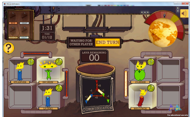
Figure 3: Floor Manager perspective in Movers and Shakers

These mechanics set the players in deliberate, direct conflict with each other, but the game itself requires direct communication beyond the screens to succeed. The physical setup is face-to-face, so that all a player has to do is break out of the game long enough to start speaking with the other player.