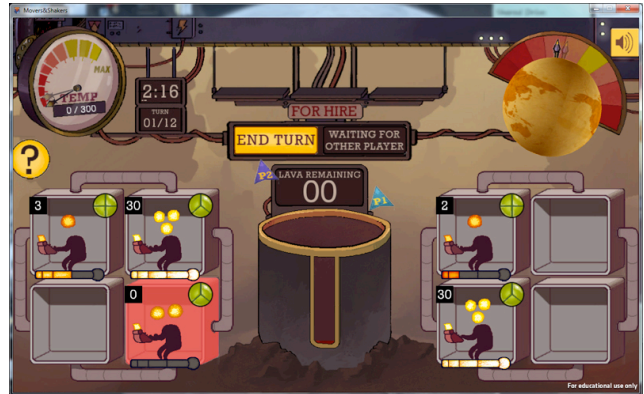
Figure 2: CEO perspective in Movers and Shakers

help them work more efficiently and effectively together. The player spends lava to improve communication between sprites, in turn improving morale. When sprite morale is high enough, the manager receives a badge; this player’s private goal is to earn four badges. Happy workers make the world spin faster; unhappy workers slow it.