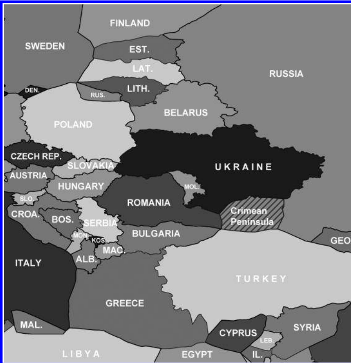
Rafi Segal and Yonatan Cohen. Territorial Map of the World, 2013. Detail showing the Black Sea region before (top) and after (bottom) the Russian annexation of the Crimean Peninsula.

Pages 52–55: Rafi Segal and Yonatan Cohen. Territorial Map of the World, 2013.