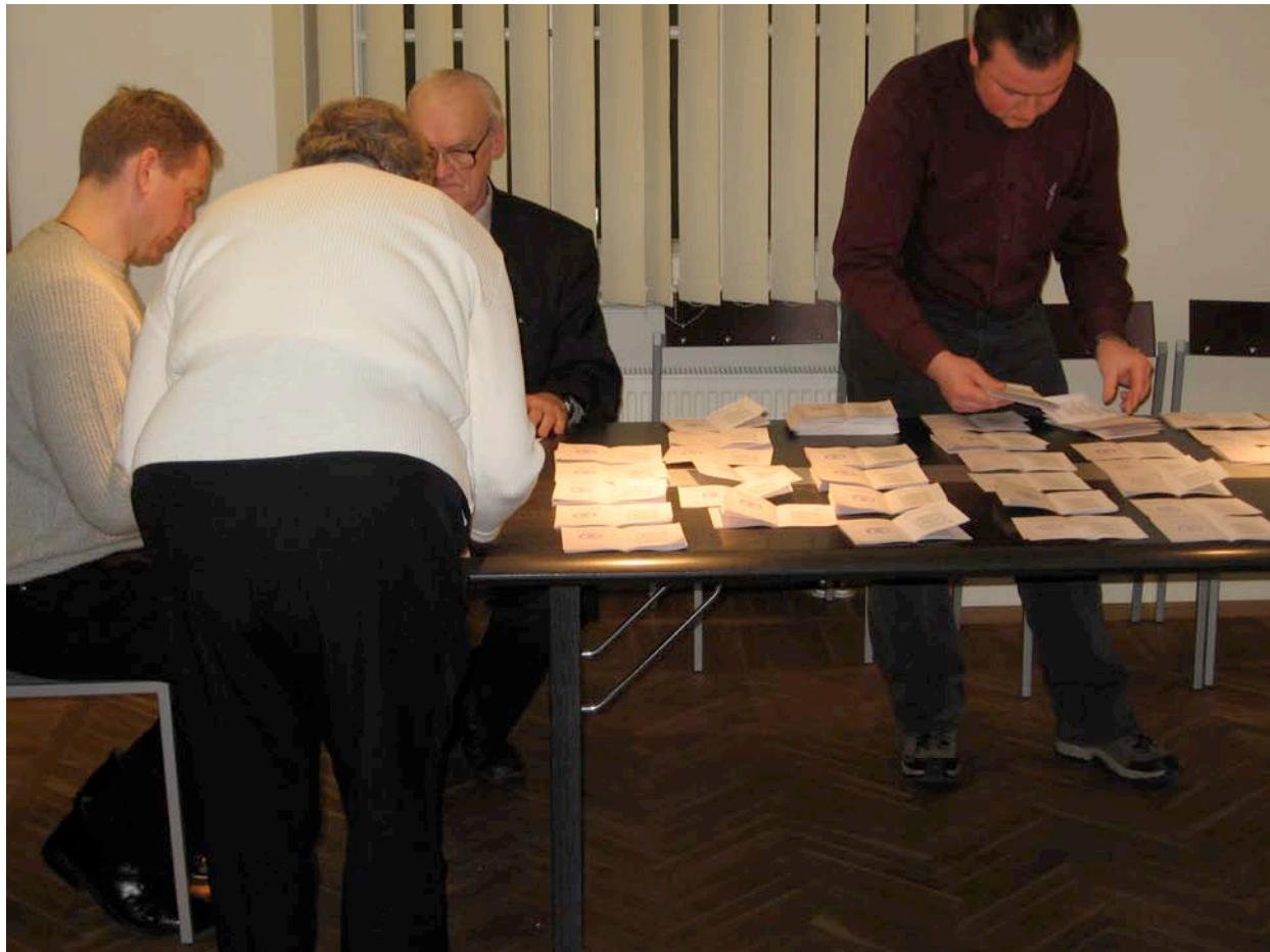
Figure 2: Counting Paper Ballots in Estonia

(Ballots are stacked by candidate number. Each stack is then counted, bundled, and the total written on the outside of the bundle.)