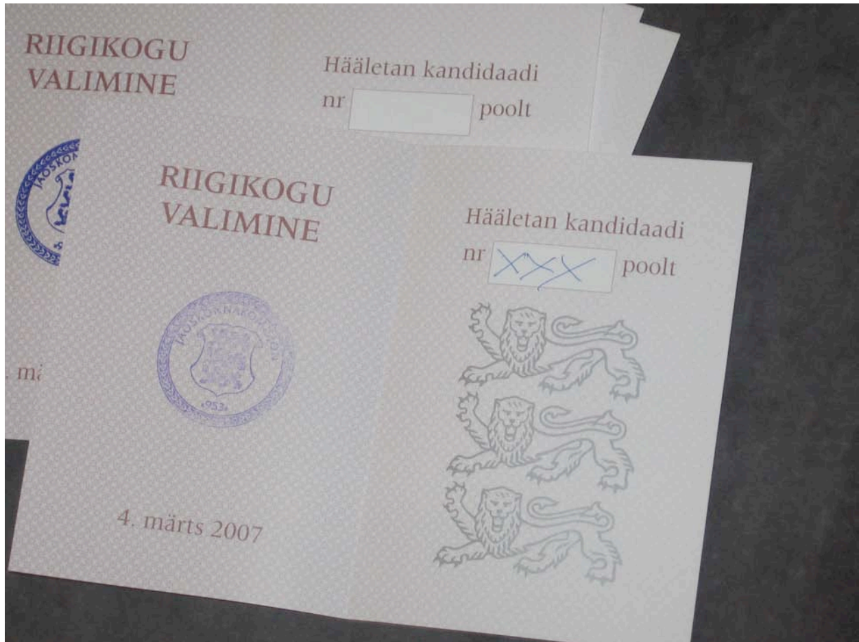
Figure 1: An Estonian Ballot

(Note that one ballot was cast blank and one is clearly a protest vote (candidates are listed by 3-digit numbers))