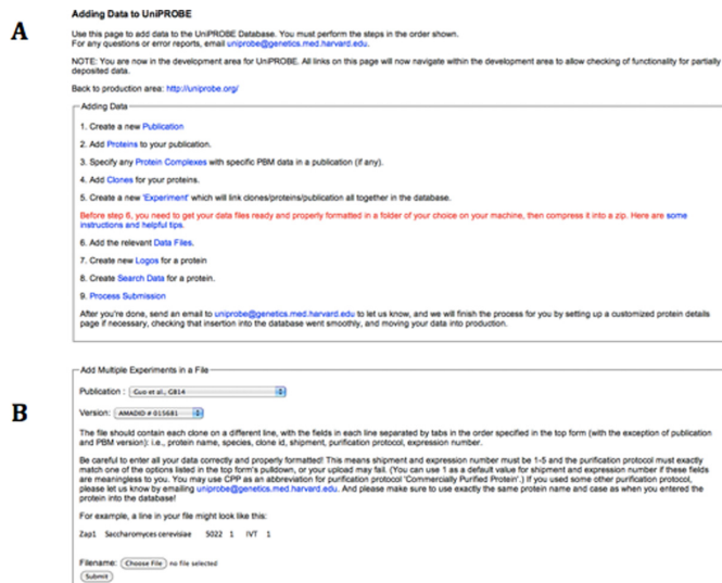
Figure 1. Data deposition pipeline. (A) The main page for the UniPROBE data deposition pipeline provides an outline of the data deposition procedure. The user successively clicks each link and follows the instructions in each step. Some steps require only the click of a button, whereas others require either submission of an input file or some extra actions on the command line. (B) The instructions for file-based input in step 5. Steps 2 and 4 have similar instructions. File-based input makes it easy for the user to simultaneously provide all the relevant information to add to the database, and has formatting, error checking and rollback functionality built in.