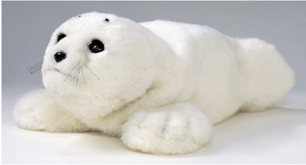
FIGURE 1 | Baby Seal Robot, PARO (Shibata, 2012).

compared to reading activity at a nursing home in RCT, and results showed reduction of anxiety, improvement of mood, and improvement of quality of life of elderly significantly (Moyle et al., 2013).