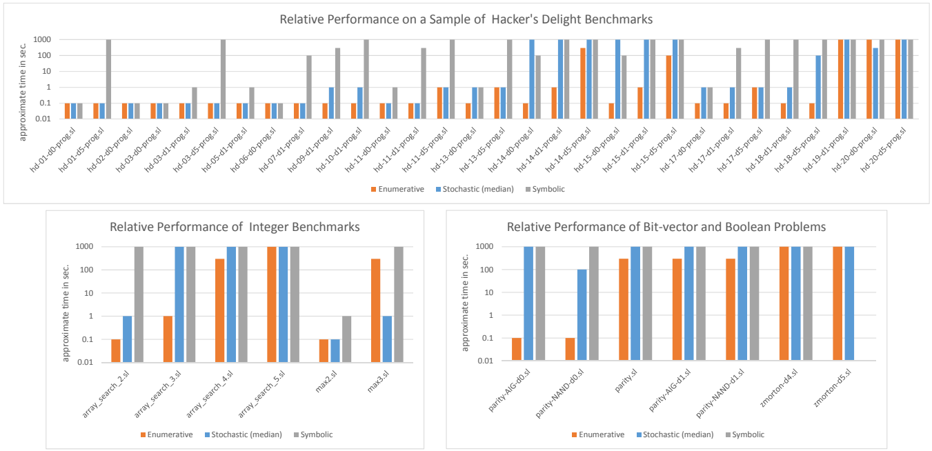
Fig. 2. Selected performance results for the three classes of benchmarks

research [4], [5], [16]. For these benchmarks, the goal is to discover clever implementations of bit-vector transformations (colloquially known as bit-twiddling). For most problems, there are three different levels of grammars numbered d0 , d1 and d5 ; level d0 involves only the instructions necessary for the implementation, so the synthesizer only needs to discover how to connect them together. Level d5 , on the other extreme, involves a highly unconstrained grammar, so the synthesizer must discover which operators to use in addition to how to connect them together.