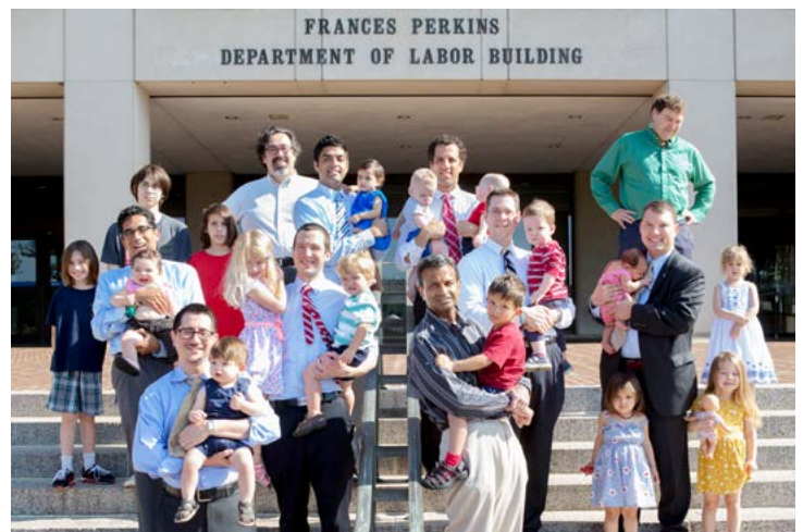
DOL fathers and their children.

Secretary Perez: “Fathers taking parental leave helps not just children but moms, too, by changing who changes the diapers and the whole culture around work and family.”