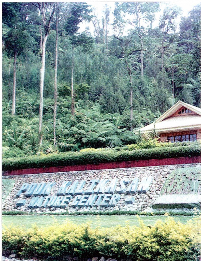
PNOC's Pook Kalikasan (at 1,300 meters above sea level), and Lake Agco (at 1,200 m) on Mt Apo in southern Philippines.