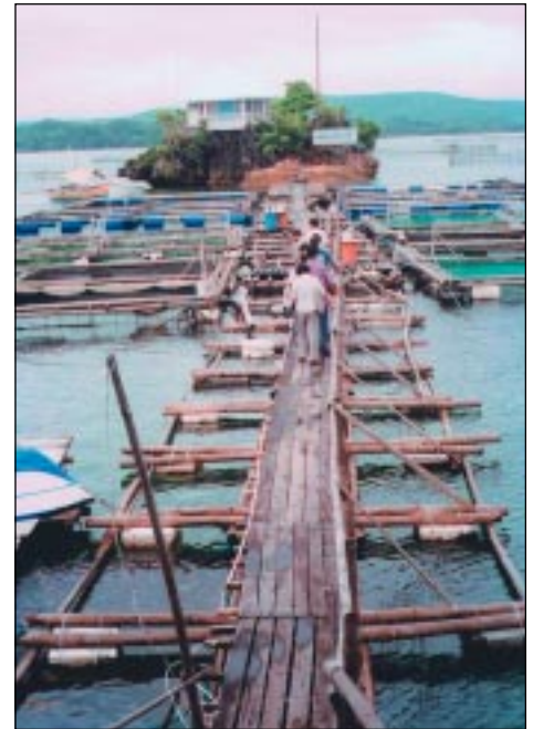
The trainees are oriented on the Igang Mariculture Park facilities during their first day