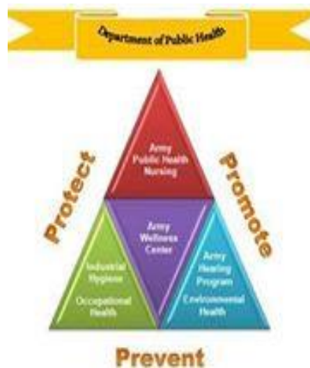
Figure 1. Fort Riley DPH logo

I completed 240 hours of my field experience at the Department of Public Health at Fort Riley Army Installation, Kansas. The DPH is comprised of six sections and partners with Veterinary Services to promote and protect the health of the community at Fort Riley. The DPH is a part of the Irwin Army Community Hospital (IACH) at Fort Riley. The mission of the DPH is “To promote health and wellness, and prevent disease and injury of Soldiers and their families, military retirees, and Army Civilian employees at Fort Riley through workplace and community health.” (Fort Riley DPH pamphlet)