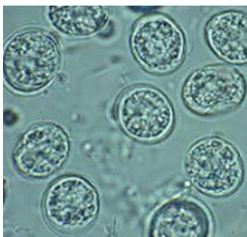
T. gondii oocysts