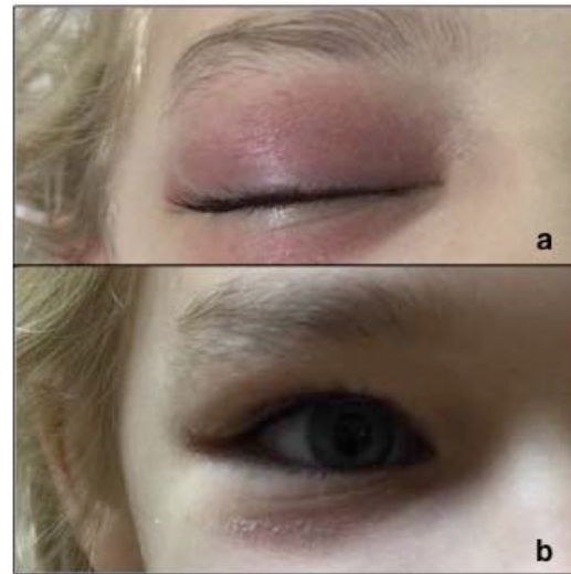
Figure 2: Coloured photograph of the patient a) prior to EOD drainage showing erythematous eyelid swelling and inability to open the eye at rest, b) day 2 post-EOD drainage showing improvement of the eyelid swelling.

Orbital abscess is a known complication of orbital cellulitis whereby pus collects within the orbital soft tissues, while subperiosteal abscess denotes collection of pus between the bones of the orbit and the periosteum. Ferguson et al reported that 62% of paediatric