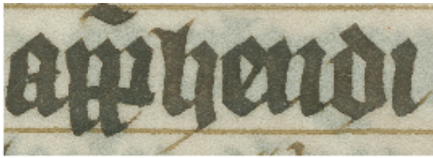
“Ap̄hendi,” with the omission mark standing for “re” apprehendi. As seen in the book of Isaiah, front page, column 1, line 3, word 3.

After transcription, the group focuses on translation. Most, if not all, students who study Latin study classical Latin; however, the manuscripts have been written in medieval Latin. This disparity can prove to be troublesome, but the overall process of translation allows for an intimate relationship to develop between the leaf and its reader. Translation allows the reader to interact with the text in a way that is most natural for them while maintaining the true meaning of the text. As stated by Dustin Meyer: