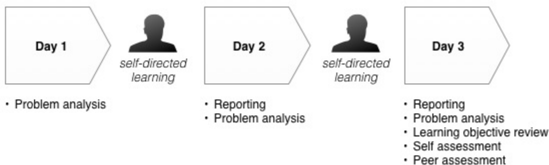
Figure 1. The process of small group learning (SGL) within the integrated curriculum.

Removing discipline-based barriers required that faculty members from different disciplines work together to integrate content across the curriculum. Cases for small-group learning were intended to prompt students to investigate topics across disciplines. As such, an interdisciplinary approach for case-writing was essential.