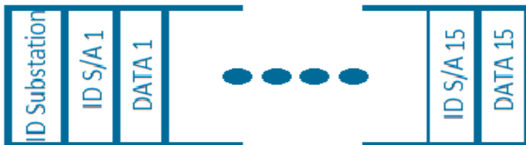
Figure 3. Proposed telematics-SCADA framework.

The operation of the Mirrored Telematics-SCADA system is based on cell phone infrastructure already installed by communication companies that usually guarantees a huge coverage area. Additionally, rural areas have the capability to support SMS service because it uses the signaling channels that do not demand complex infrastructure to interchange user data such as GPRS or EDGE. Figure 3 illustrates the proposed telematics-SCADA framework. The system is capable of managing up to 4096 substations with 10 sensors or actuators with 8 bits of resolution. The framework was designed considering the following aspects: ID Substation (12 digits), ID Sensor/Actuator (4 digits), DATA (8 digits), and 8 digits of Hamming code (linear error-correcting code) to detect up to two-bit errors. Thus, the length of the framework is 140 digits that correspond to the typical SMS number of ASCII symbols accepted by a single message. In addition, the system is bidirectional between mirrored control centers, and remote substations. Finally, all data are updated each minute, but could be faster depending upon the availability of the cell phone infrastructure.