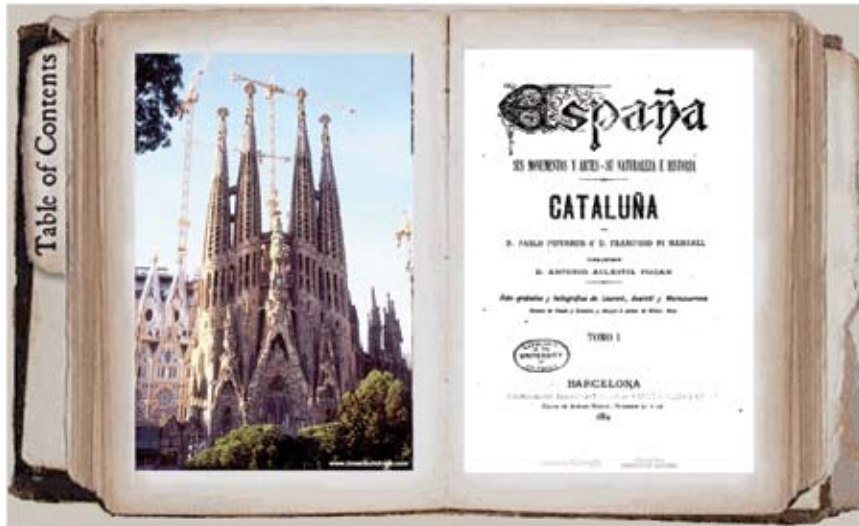
(The image presented here is a mashup: for the actual book in HathiTrust, see http://hdl.handle.net/2027/uc1.b543888 )