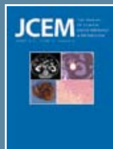
The Journal of Clinical Endocrinology & Metabolism

JCEM was recognized as one of the top 100 most influential journals in biology and medicine over the past century. —By the Special Library Association.