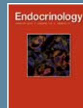
Endocrinology & Molecular Endocrinology

An In-depth, Enduring Resource With the Highest Impact Factor in Endocrinology and Metabolism