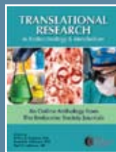
Translational Research in Endocrinology & Metabolism