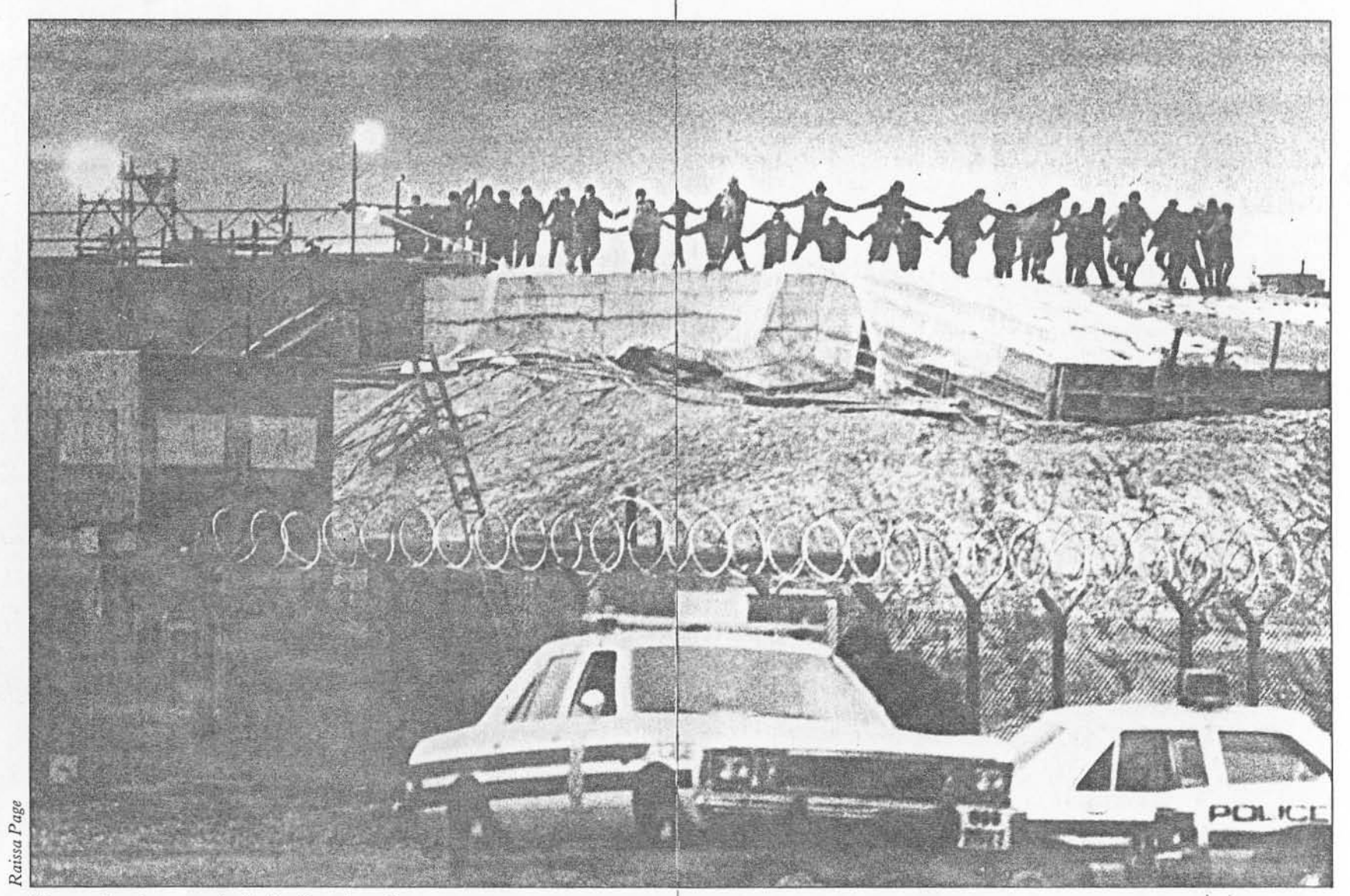
Women dancing on a missile silo, Greenham Common, 1 January 1983