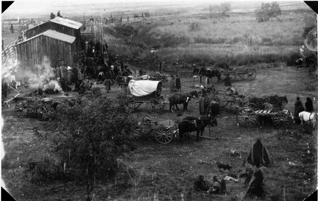
FIG. 2. "Beef Issues, Northern Cheyenne,"