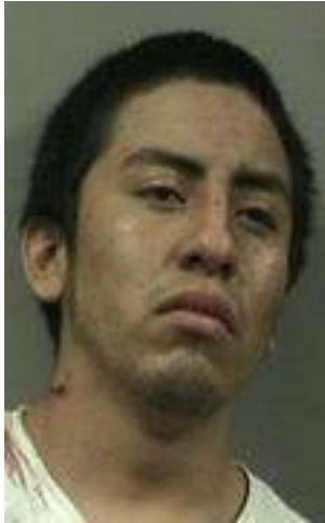
Text 25: Photo 1

image is there for the purposes of a crime investigation. This appears to be standard procedure in newspaper crime reports. However, when compared with crime reports of offenders of a different social status (such as CEOs), we can see a stark contrast. The following photos of Latino migrants are compared below with the photos of Bernard Madoff and Martha Stewart (CEOs convicted of crimes) in order to show the contrast between how dominant and non-dominant groups are shown visually in crime reports. 67