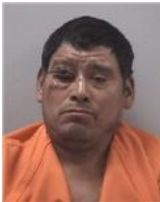
Text 20: Photo 2