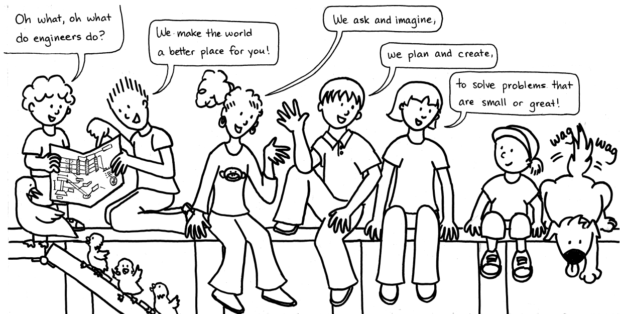
Figure 1. Sample page from developed engineering storybook.

The text of the storyline allows the reader(s) to become an active player in a journey to find the "engineer" through several artifacts and locations that illuminate aspects of the engineering occupation through what, where, who and why questions. In addition, the storybook repeats the word "engineer" multiple times (n=8 in text, plus twice in title pages), as research has shown that repetition is important for children to absorb new words. 10,11 The illustrations contains both misconceptions of engineering (i.e. engineers fix cars like mechanics do) as well as engineering imagery (e.g. turbine, blueprints). Several sections of the book were left intentionally vague to facilitate conversation. For example, a blueprint of the ramp was provided within the illustrations, but was not referenced in the text.