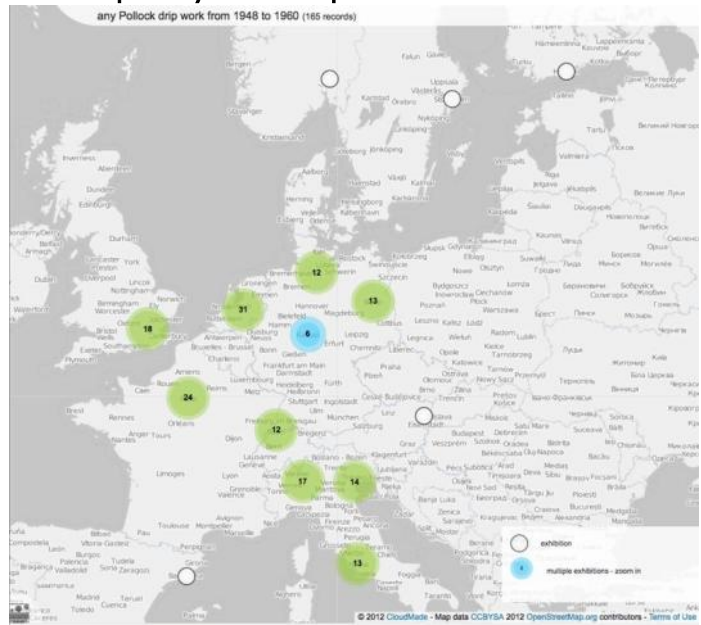
Map 4. Any Pollock drip work from 1948 to 1960

The analysis of Pollock's works presented in Europe was extremely useful. Collecting data from 1948 to 1960, I found that eighty-six Pollocks had been presented on the Old Continent, of which about 55% were drip paintings. During those twelve years, Europeans had more than four hundred opportunities to see a Pollock, of which 42% involved drip paintings (Map 4). Before 1958, there had only been one hundred seventy-six opportunities to see a Pollock painting, of which 40% involved drips. Between 1948 and 1960, 23% of the Pollocks shown in Western Europe came from Peggy Guggenheim's Collection. Between 1948 and 1957, her Pollocks counted for 52% of the Pollocks shown in Europe. The most widely exhibited Pollock was the She-Wolf (1943). It was shown twenty times all over Europe between 1953 and 1959. Among the earliest and most widely shown paintings was the Moon-Woman (1942), which was shown eight times before 1956, mostly in Italy. Among the drip paintings often seen in Europe was Full Fathom Five (1947), which was presented eleven times in seven different countries between 1950 and 1959. 13