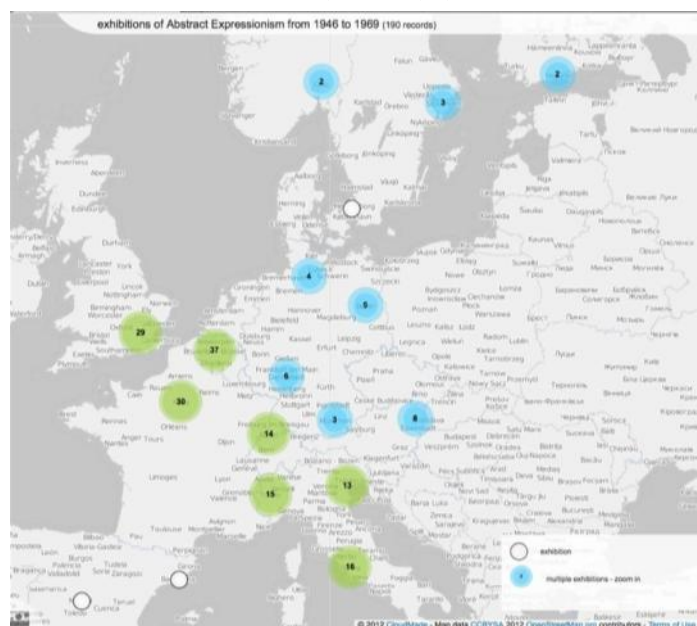
Map I. Exhibitions of Abstract Expressionism from 1946 to 1969

Screen capture from unpublished, development web interface