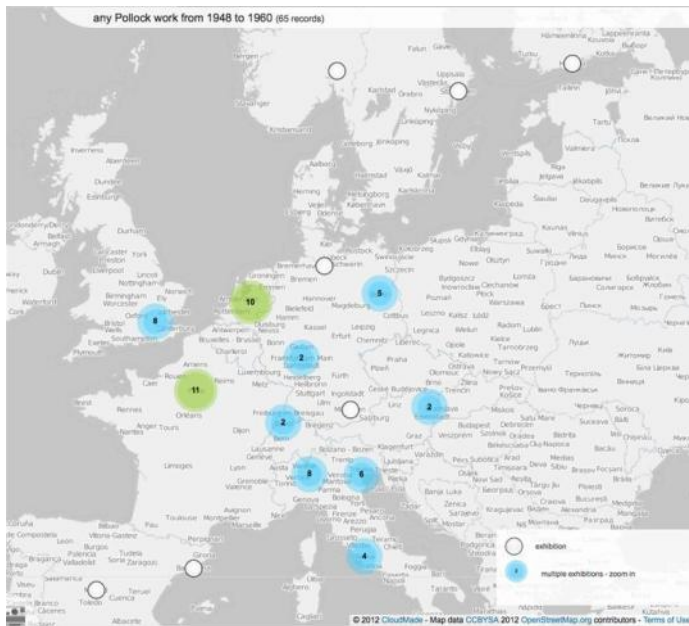
Map 3. Any Pollock work from 1946 to 1969

Although the approach by artist was more productive and less problematic than the approach by style, the fact that artists change styles throughout their careers made it challenging sometimes. For Pollock, it was a real problem. Seeing a Pollock painting could mean very different things. When Europeans saw a Pollock, did they see an early figurative work, a surrealist painting, a drip