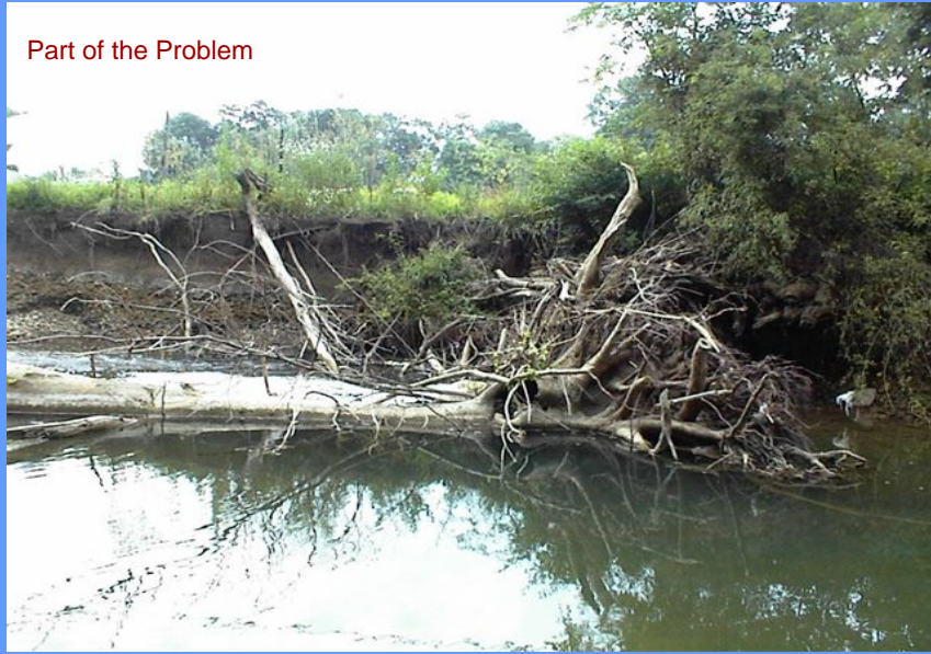
Part of the Problem