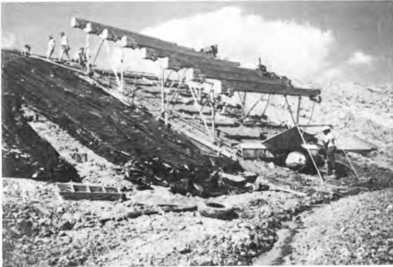
Figure 4. Research to predict erosion losses from highway embankment slopes is one of 27 current JHRP research projects.

estimated that even a small increase in pre-winter crack sealing activity can result in a large saving in post-winter patching activity resulting in a substantial net cost saving. Furthermore, the same project has provided much needed detail cost and fuel consumption data on various maintenance activities that can be used for effective management and control. Yet another project has developed a simple procedure that can be used to identify and implement areas where maintenance productivity can be improved. Current work is underway to improve the maintenance productivity can be improved. Current work is underway to improve the maintenance planning and management process.