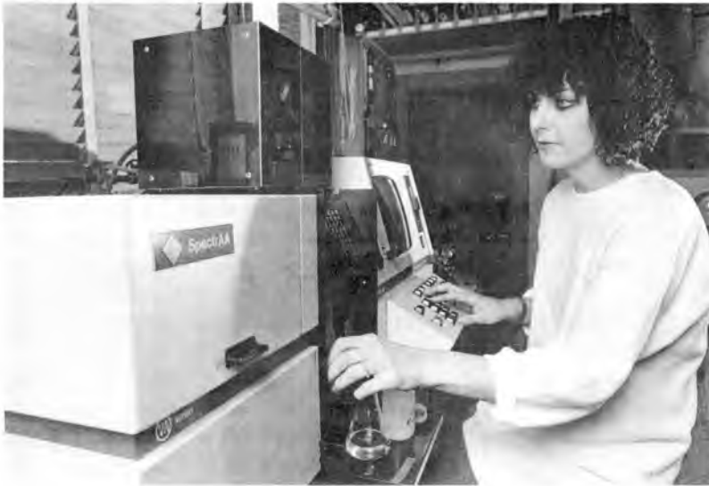
Figure 5. The fundamental objective of research is to find new knowledge.

The computer has revolutionized activity everywhere and it still continues. Modern communications govern much of what we do. Travel and transportation leaders find clearly that their future, although heavily affected by financial resources available and environmental concerns, are