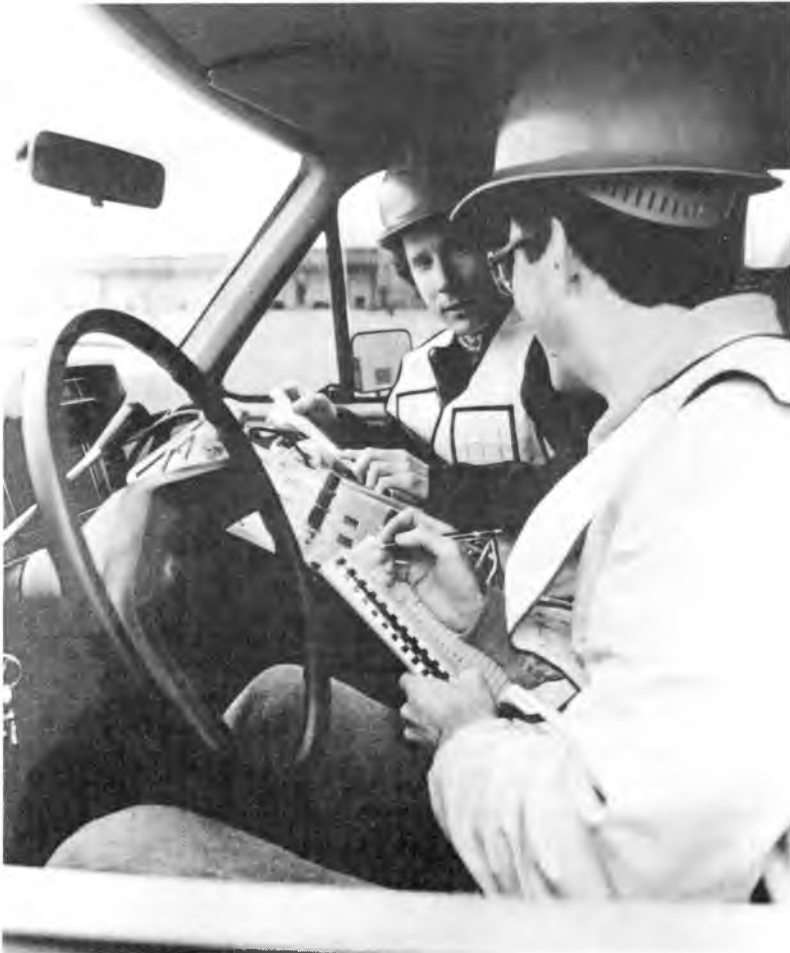
Figure 6. Perhaps the greatest benefit of an academia-government research program is the number of young men and women who are attracted to the profession, educated in the profession, and retained in the profession—the future leaders in civil engineering.

our reputation as a University, and expands the loyalty of our alumni—all so valuable to a university today.