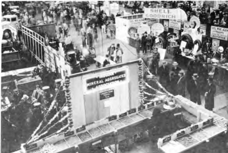
Figure 1. The Annual Purdue Road School began in 1913 and soon thereafter included a Road Show in the Purdue Armory.

This is also the 75th year for the school to hold a state-wide highway conference at Purdue. In January 1913, W. K. Hatt, head of the School