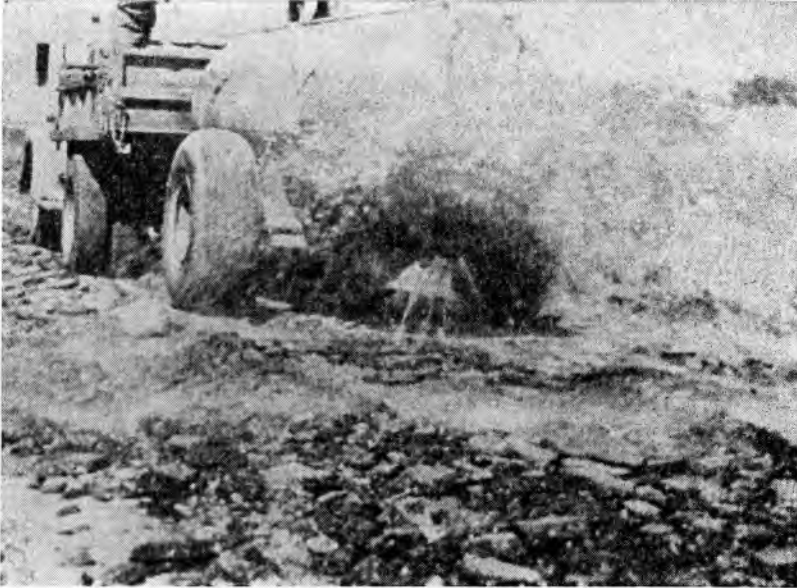
Figure 1. A converted liquid manure spreader applies the SA-1 solution to the scarified bituminous roadway.

on top of the windrow. Local contractors have also used a dozer-towed sheepsfoot roller. The grader and sheepsfoot roller work together as a team, with the grader providing mixing action while the sheepsfoot rides on top of the windrow to further assist in the breakdown.