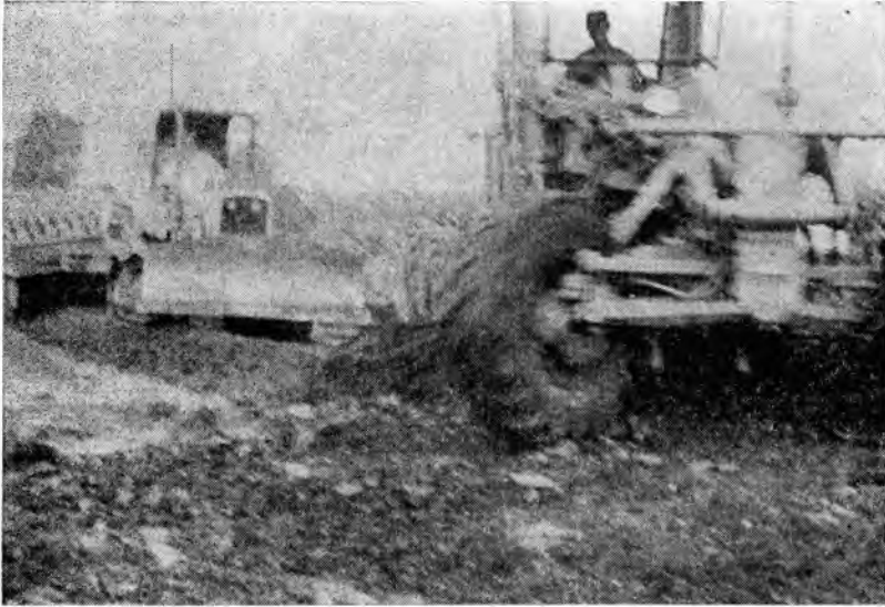
Figure 2. A motor grader and dozer-towed sheepfoot roller aid the chemical breakdown by providing both mixing and crushing action.

Blading of the recycled material to the desired width and crown may now proceed. Care should be taken not to mix the native subgrade soils, especially clayey or silty soils, into the recycled base mixture. Generally, due to time limitations, the mixture is spread across the road and left open to traffic overnight. You may decide to let traffic do the majority of the compaction and use a roller to obtain uniform compaction in those areas which are not subjected to direct wheel loads.