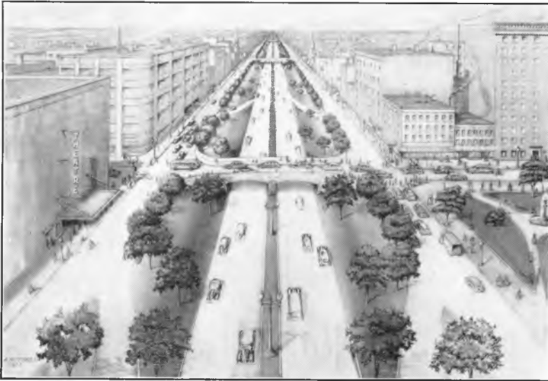
Fig. 11. There is great need for express highways cut directly into and through cities. This sketch shows how it may be done.