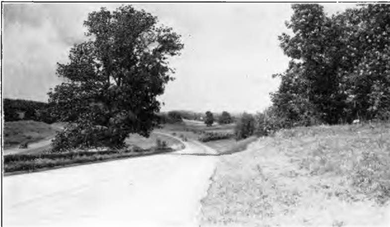
Fig. 9. The median strip need not be of constant width, and the separated pavements need not be at the same elevation or have the same curvature.

The median strip need not be of constant width and the two pavements separated by it need not be at the same level. It may be necessary to change the distance between paved roadways at definite locations, such as on long bridges where for economical reasons it may be necessary to reduce widths to 4 or 6 feet. Four-lane, undivided highways and those flush with median strips paved to the general level of the adjoining traffic lanes are treated like two- and three-lane highways with respect to crown and superelevation. The highest point of crown is at the center, and the road drains to both sides.