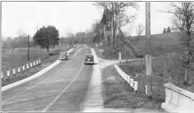
Fig. 3. Sight distances are inadequate on this three-lane road; however, the lane markings serve to reduce hazards.

Opinion is sharply divided as to the wisdom of three-lane construction. The design capacity of a three-lane highway is approximately 75 to 100 per cent greater than the capacity of a two-lane highway, but this figure varies considerably. Some believe that the capacity of the three-lane highway is about 50 to 70 per cent of the capacity of a four-lane undivided highway for traffic traveling at the same speed on each. It is believed by some who have observed the operation of three-