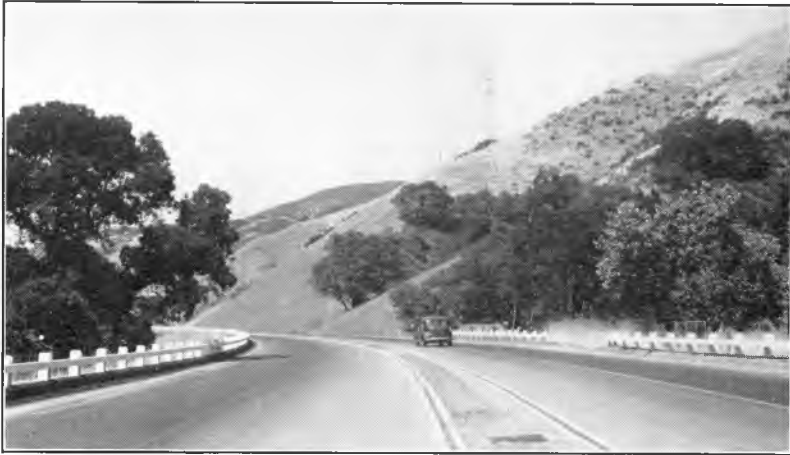
Fig. 5. A four-lane divided highway with narrow, raised, and paved median strip four to six feet wide.