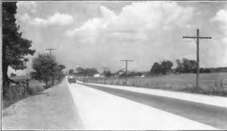
Fig. 2. A three-lane highway should have good sight distances with traffic lanes of contrasting colors and should be considered as a temporary expedient in an ultimate four-lane development.

Opinion is sharply divided as to the wisdom of three-lane construction. The design capacity of a three-lane highway is approximately 75 to 100 per cent greater than the capacity of a two-lane highway, but this figure varies considerably. Some believe that the capacity of the three-lane highway is about 50 to 70 per cent of the capacity of a four-lane undivided highway for traffic traveling at the same speed on each. It is believed by some who have observed the operation of three-