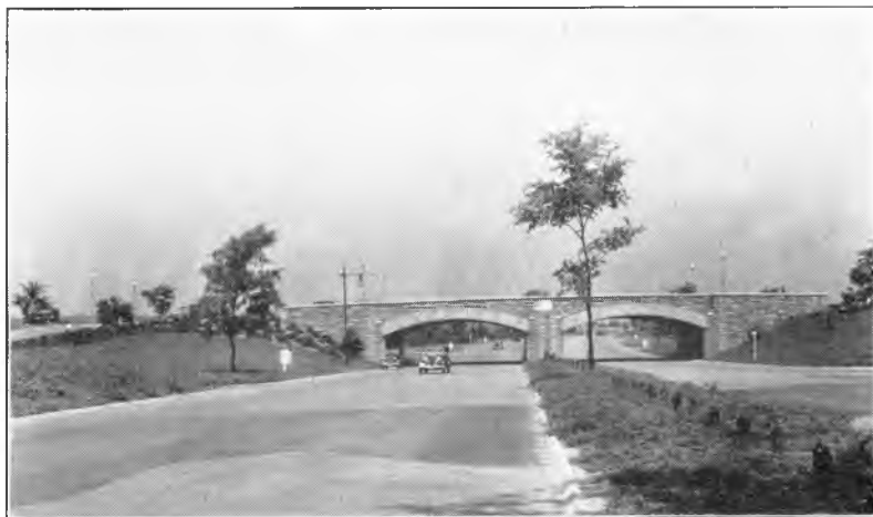
Fig. 7. The Mount Vernon Boulevard with artistic grade separation structure is an excellent example of divided-lane construction.

At intersections at grade, the median strip dividing opposing traffic should be opened up and designed to accommodate the expected traffic that turns and crosses at these points. The width of the median strip combined with the length of opening should safely accommodate vehicles making left turns to and from the inside lanes of the divided highway and should, if possible and feasible, accommodate U-turns. Unnecessarily long openings encourage promiscuous driving and should be avoided. The desirable width of median strip at highway grade crossings is at least 25 feet for P or passenger