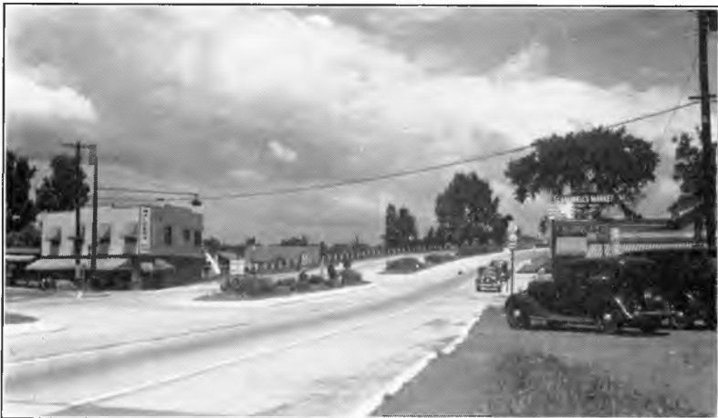
Fig. 6. A four-lane divided highway with planted median strip and sloping curbs, ten to twelve feet wide.

At the present time practically all highway designers agree on the basic principle that four-lane highways should be separated by a dividing strip of appreciable width. However, practice varies considerably as to profile, widths, lengths, and materials used in their construction. Points for consideration are design of strips at intersections, between intersections, over bridges, under bridges, in urban areas, and in rural areas, as well as the type and dimensions of vehicles