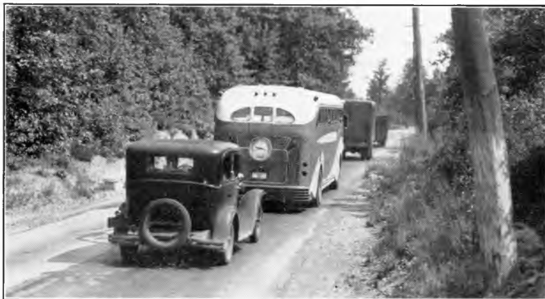
Fig. 1. A two-lane pavement carrying a procession of slow-moving vehicles on a long upgrade headed by a truck and trailer unable to climb the grade at normal driving speed.

approximately 50 vehicles per day, and the width of the pavement should be not less than 10 feet.