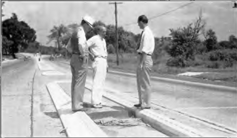
Fig. 10. Illustrating construction of high-visibility fluted curbs with flat slopes on narrow median strips.

Curbs intended to prevent vehicles from leaving the pavement should be nearly vertical and at least 2 feet from the pavement edge. At all other places curbs, when used, should be low with flat slopes readily mounted in emergencies. All curbs should be highly visible at all times.