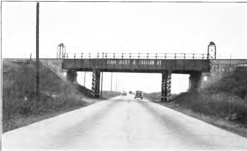
Fig. 1. (See Fig. 2.) E. J. & E. R. R. subway, in west part of Gary near East Chicago Corporation Line, on U. S. 12. Traffic reaches 8,000 vehicles per day. Note two-lane pavement, columns, and no sidewalks. Widening of highway to four lanes (42') necessitated reconstruction of subway.

1. Wider roadways on both structure and approaches. (Figs. 1 and 2.)