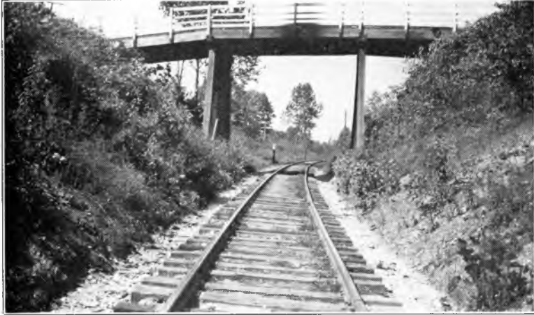
Fig. 9. Before. (See Fig. 10.) S. R. 58 over C. M. St. P. & P. R. R. east of Burns City in Martin County. Old structure weak, flimsy handrail. Poor profile on approaches and a hump over structure. Only 14\frac{1}{2}' clear roadway.

turn out to be an actual economy due to reduced maintenance charges. The other is the extensive use of continuous steel beam designs for the overhead structures, which frequently reduces the height of the approach fills because of the use of beams of shallower depth.