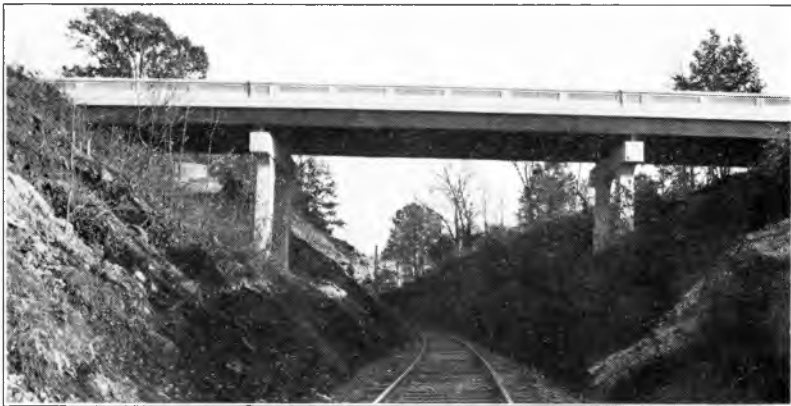
Fig. 10. After. (See Fig. 9.) Three-span steel-beam continuous—concrete bents. Grade, straight 2%. Note splices in center span. One of earlier continuous designs—had to discontinue placing splice at these points on account of cambering difficulties—moved splice back to directly over piers on later designs.

As a matter of interest—we camber all steel spans, whether simple or continuous, so that under full dead load of superstructure, including handrails, they deflect to the exact theoretical profile whether on a straight grade or a vertical curve. W.P.G.S. Project. Cost—$18,000.