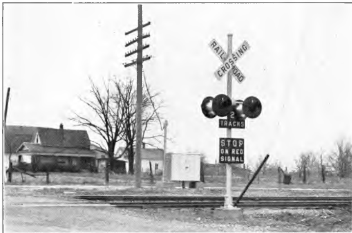
Fig. 11. Modern flasher signal. Notice reflectorized signs.

Many grade crossings have been eliminated by road relocations, more than 100 crossings have been eliminated by grade separation structures, and over 200 flasher signal installations (Fig. 11) have been made by the State Highway