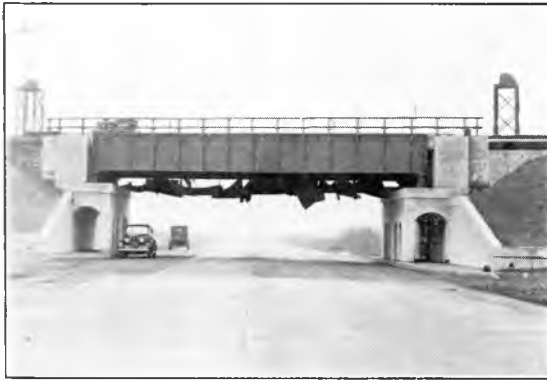
Fig. 2. (See Fig. 1.) Old columns removed, new steel superstructure designed and erected, and abutments remodeled. Pedestrian sidewalk tunnels provided. Clear width, curb to curb, 42'. Note scaffolding and tarpaulins during painting. Entire design and handling of contract by state. W.P.G.M. Project. Cost—$51,000.

2. Wider shoulders on the approaches with flatter side slopes and guard rail protection where needed.