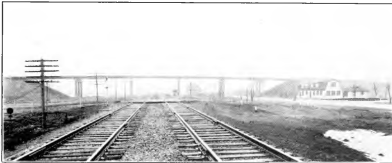
Fig. 7. (See Fig. 6.) Six-span continuous steel beams crossing U. S. 30 on right, county road on left, and railroad in center. Note interchange connection on extreme right. Considered a subway at this point—gave it up because of drainage problem—general ground water level only a foot or so below top of ground. Note water on right. Beams only have been erected. W.P.G.H. Project. Cost—$117,000.

7. Very careful study of the drainage problems, especially at underpasses.