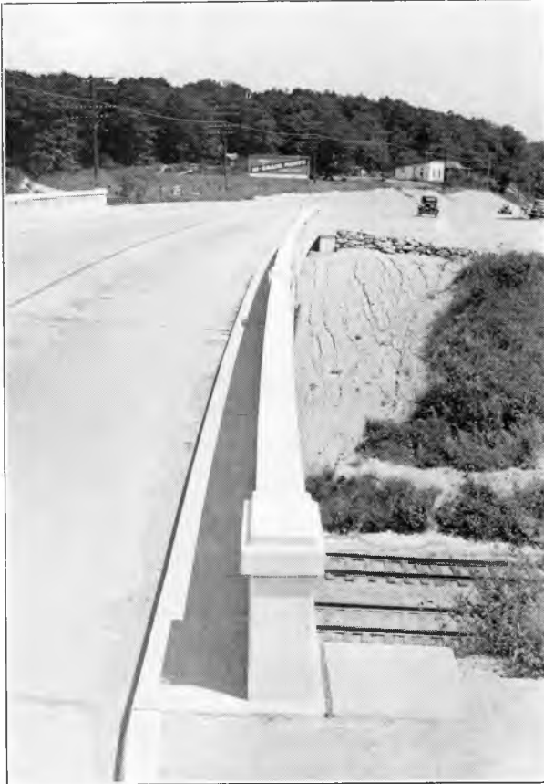
Fig. 8. S. R. 43 over Big Four and Nickel Plate Railroads, south of Lafayette. Three-span steel beams on concrete bents and bridge built on horizontal curve. Note curved lines. Structure also on a vertical curve. 1935 N R. Project. Cost—$31,000.