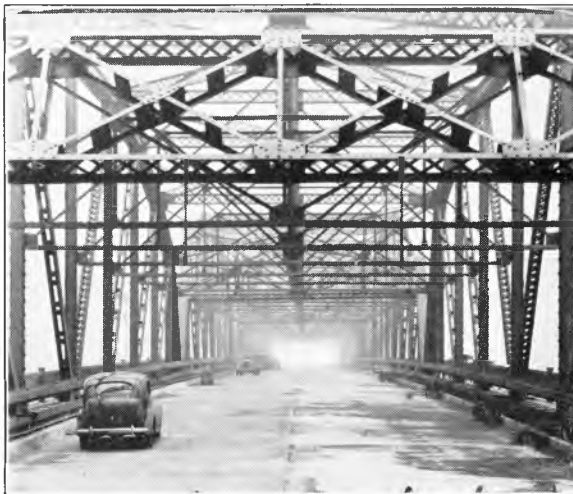
Fig. 5. View through trusses of Fig. 4. Notice heavy vehicular guard rail just above lower chord.