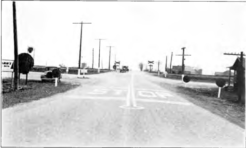
Fig. 6. (See Fig. 7.) S. R. 29 (U. S. 35) and Pennsylvania R. R. and U. S. 30 north of Knox in Starke County. Note short distance from R. R. to U. S. 30 and difference in elevation. Very dangerous when traffic was heavy.

6. Adequate vertical and horizontal clearances. (Figs. 6 and 7.)