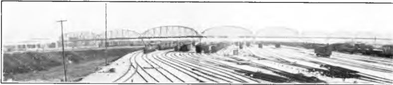
Fig. 4. This is a side elevation of the largest and most expensive grade separation structure ever built by the State Highway Commission, in fact the largest bridge ever built by the state where the state handled the entire project—the design and preparation of the detail plans, the letting of the contract, and the inspection and supervision of the construction. (See Fig. 3.) In Hammond near East Chicago corporation line. Structure proper consists of 9 through truss spans, all skewed one panel and varying in length from 170 feet to 245 feet, and 8 R.C.G. spans at 42 feet each.

5. Much better alignment and grades than were formerly considered necessary, with a corresponding increase in the sight distance provided. (Figs. 3, 4 and 5).