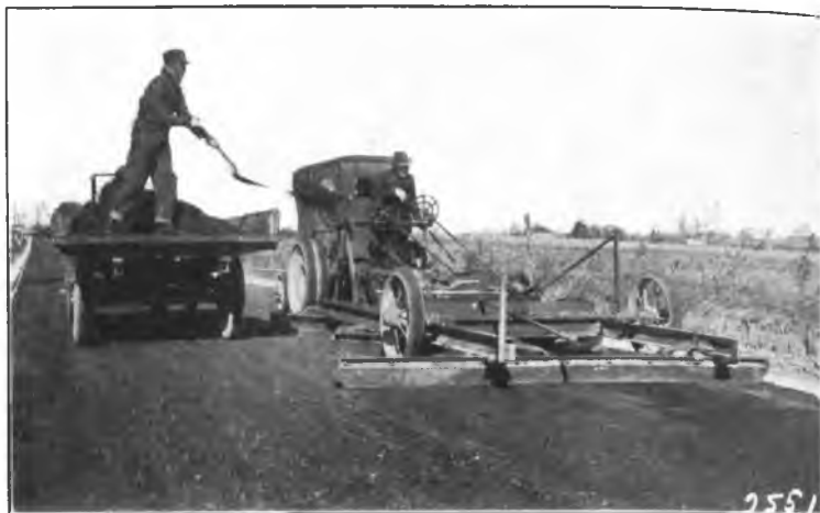
Fig. 4. Feeding Pulverized Rock Asphalt in Front of Planer as Part of Smoothing Process.

eral times with the planer, the surface was again rolled and where necessary further planing done. In all cases, the final rolling was done with a 10-ton, 3-wheel roller. We were not able to conclude from our experience as to how much merit there may be in using a light roller for the first rolling.