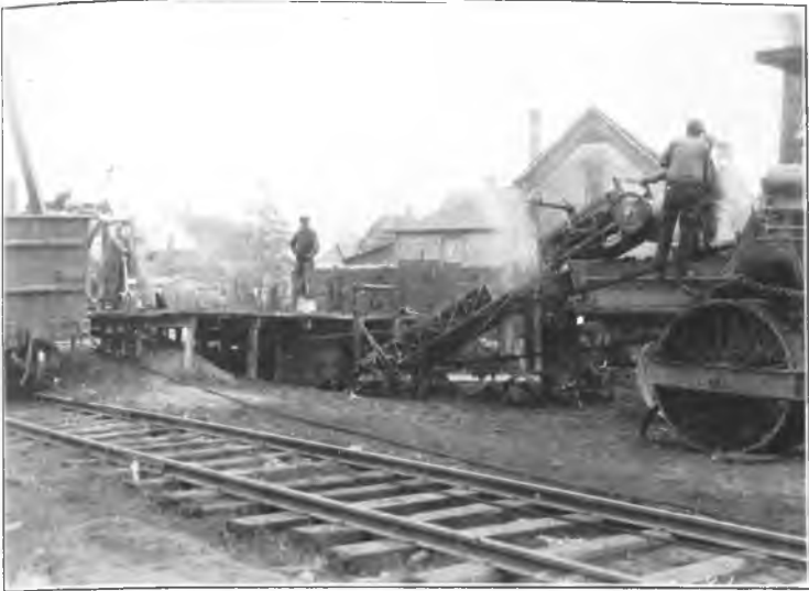
Fig. 1. Unloading Rock Asphalt from Cars, Grinding and Loading in Trucks.

Cold Pulverized Rock Asphalt. The rock asphalt was passed through a pulverizer stationed either on the road surface just ahead of the spreading or at the side of the car where