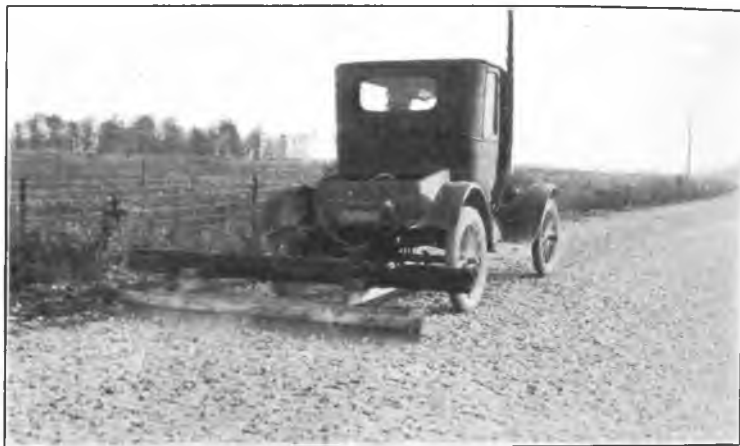
Fig. 5. Sweeping No. 4 Covering Stone into Voids Before Third Coat of Bitumen.

After the surface has become solid and just preceding the application of the third coat of bituminous material, the voids in the surface shall be uniformly filled with loose No. 4 grade A covering. No rolling or traffic shall be permitted on this loose covering before the third application of bituminous material. (These voids can best be filled by uniformly spreading same on the surface and sweeping them by hand brooms or with a broom dragged behind a light truck or car [Fig. 5].) If an extremely