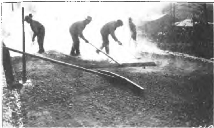
Fig. 3. Raking and Luting Steam Heated Rock Asphalt.

trucks just ahead of the shovelers and shoveled into place. Metal strips \frac{1}{4} inch thick, 1\frac{1}{8} inches wide and about 18 ft. long, bent at right angles near one end to prevent them from tipping over, were laid 3 ft. apart on the road surface to be used as a guide in gauging the thickness of loose material. Rock asphalt was then raked to as near the proper elevation of the metal strips as possible and afterwards brought to the exact level of the metal strips with a 3\frac{1}{2} -inch triangular lute 4 ft. long having a handle 12 ft. long. On some of the work 7-ft. lutes were used. This longer lute rested on three of the metal strips as it was pulled forward. With these lutes, the loose rock asphalt was brought to a very uniform surface. As the metal strips were slid forward, the loose material behind was leveled by cross-luting with an oak lute 1 inch thick and 6 ft. long having a handle 12 ft. long. By this cross-luting the marks left by the metal strips were removed. (Fig. 3.)