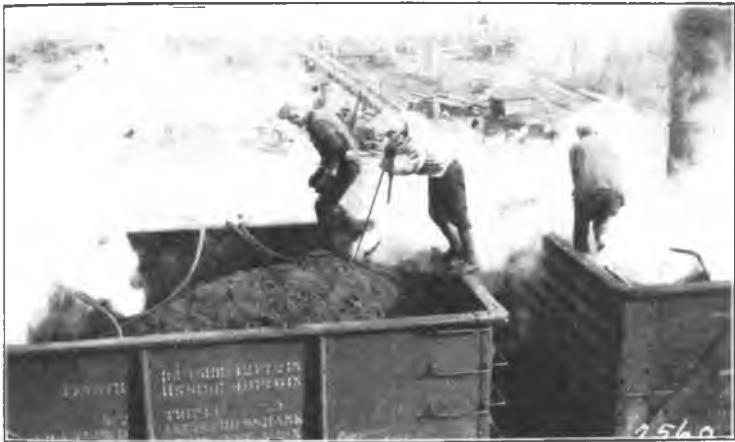
Fig. 2. Steam Heating Rock Asphalt in Cars.

the shovel dumped the cold, lumpy material directly into the pulverizer. This pulverizer consisted of a cylinder and concave from an old threshing machine with about two-thirds of the teeth removed. The cold rock asphalt was finely ground