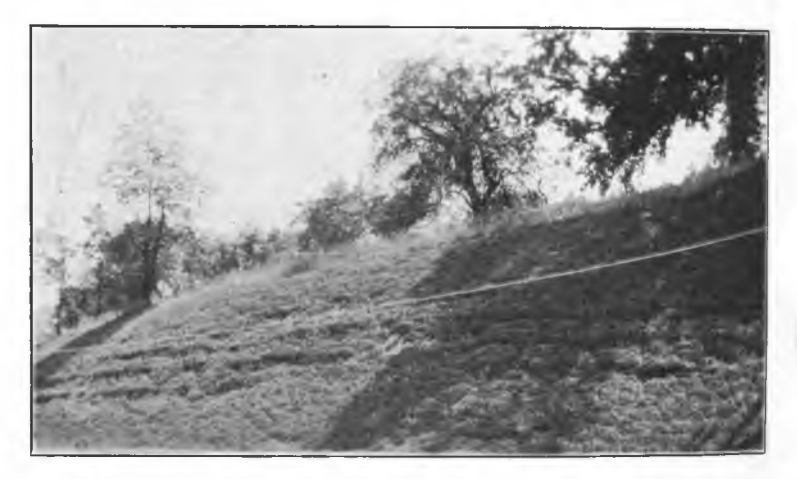
Fig. 2. Slope Seeded.

struct drainage structures of insufficient width. It is financially excusable to permit a narrow structure to remain where the structure is in good condition and the cost excessive. It is, however, bad practice to reconstruct the average small drainage structure on a two-lane pavement without allowing