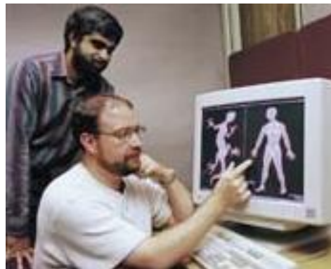
FIGURE 1 PATTERN RECOGNITION IN INTELLIGENT COMPUTER VISION

The ultimate objective of research is to create a complete-decision maker which allows us to detect the new state and initiate appropriate actions taking and analyzing all historical and current information based upon adaptive reasoning. Computers have the ability to extract information from multiple sources and identify and track patterns of activity that are inconsistent with "normal" operations.