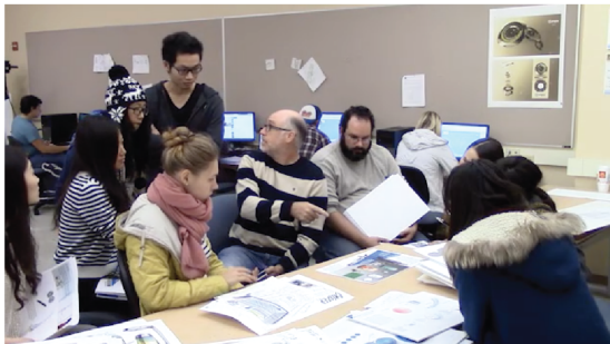
E7 Simon enlists Julian to critique Eva's work